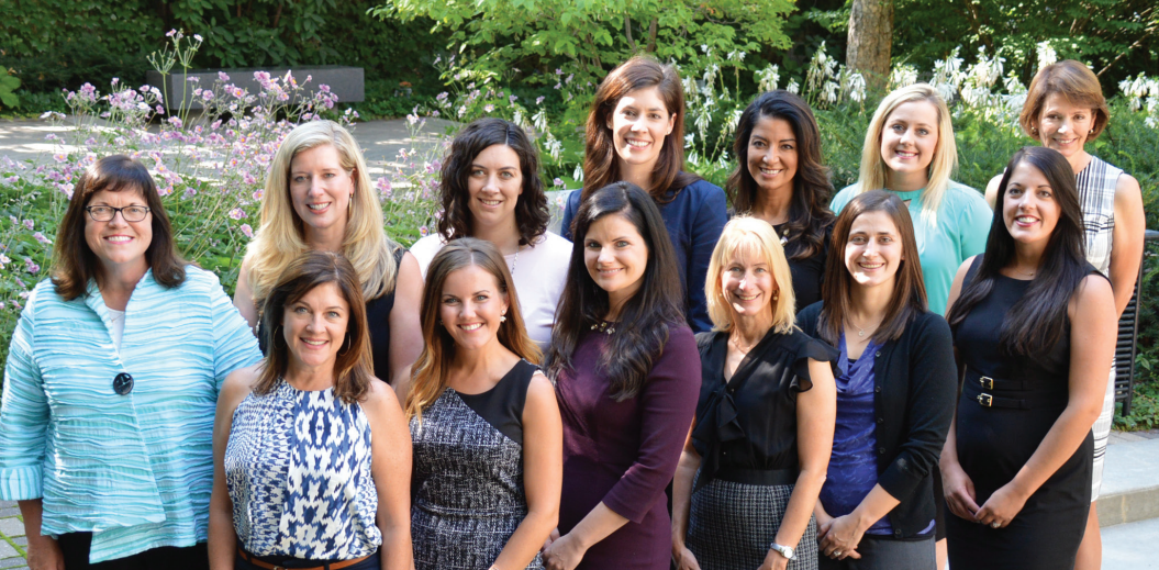
The founders of 100's of Women Who Care Lincoln in 2017.